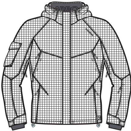
K0701 / Jasper