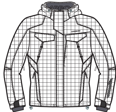
K0522 / Beam