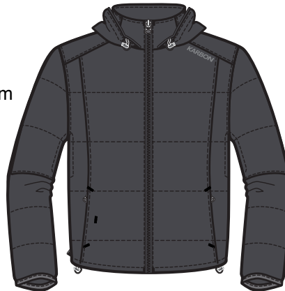
KA408 Gemini II / KA481 Zirconium